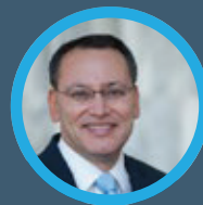
Dr Shane Reti